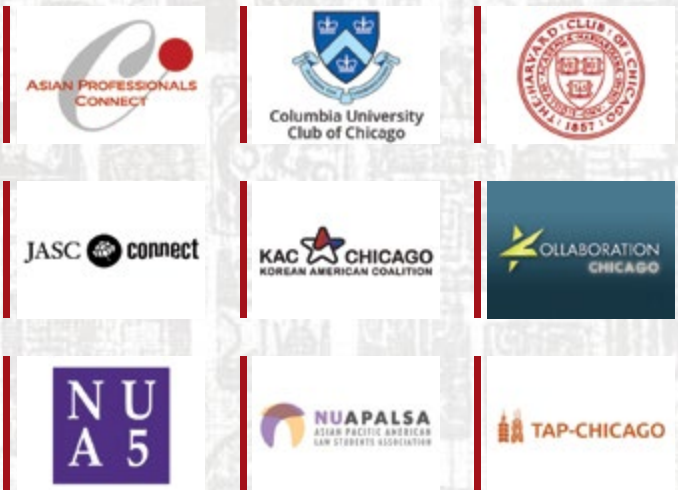
A few of our 2014 Community Organizations

We welcome your organization to become a Lunar Ball community partner. With your help, we will engage more local organizations and extend outreach into the community.