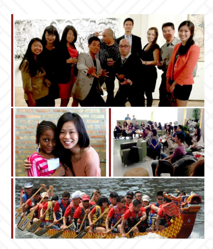
A few of our 2015 Community Organizations

We welcome your organization to become a Lunar Ball community partner. With your help, we will engage more local organizations and extend outreach into the community.