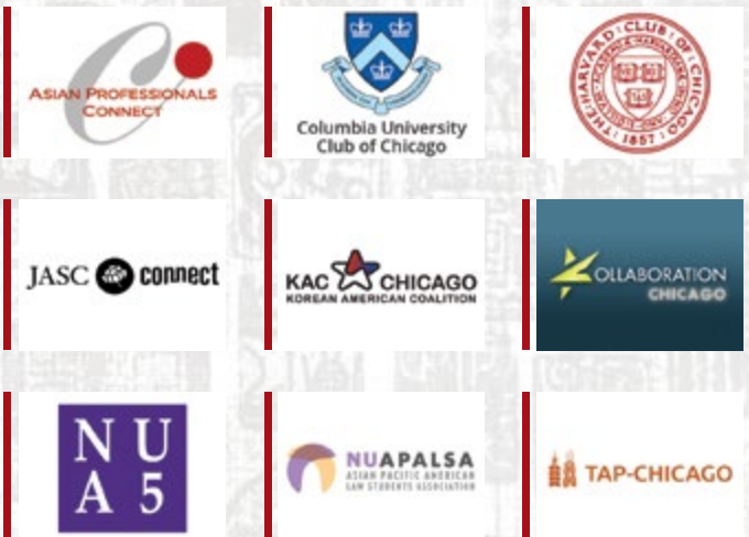
A few of our 2014 Community Organizations

With the thriving community, we welcome you to become a Lunar Ball Tasting Item Sponsor. With your help, we will engage more local organizations and extend outreach into the community.