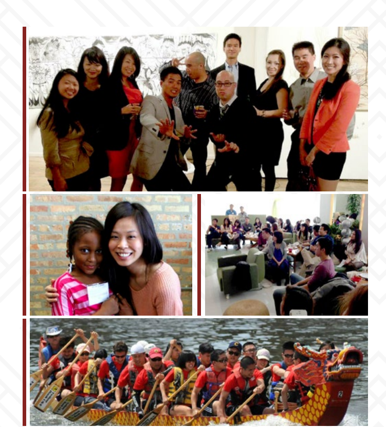
A few of our 2015 Community Organizations

Last year, 32 diverse Chicagoland community organizations took part in Lunar Ball to celebrate the special holiday and help support essential social services. The 8th Annual Lunar Ball will include even more organizations. We welcome you to become a Lunar Ball Beverage Sponsor and engage with our growing community.