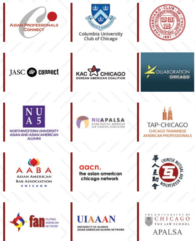
A few of our 2015 Community Organizations

Last year, 32 diverse Chicagoland community organizations took part in Lunar Ball to celebrate the special holiday and help support essential social services. The 8th Annual Lunar Ball will include even more organizations. We welcome you to become a Lunar Ball Beverage Sponsor and engage with our growing community.